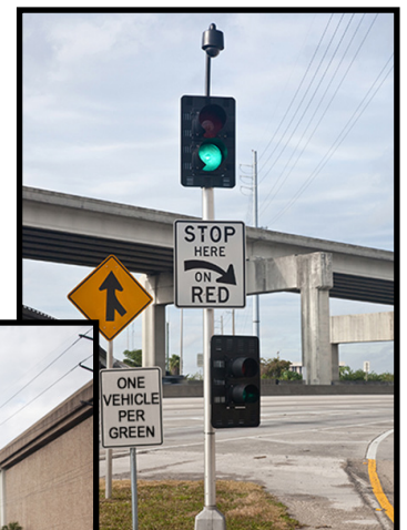
Ramp Signals Operational in Miami

For more information on the 95 Express Phase 3 Project, please call or email: